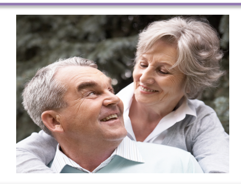
Initial Research Visit Include

The enrollment visit takes approximately 2 hours. During this time: